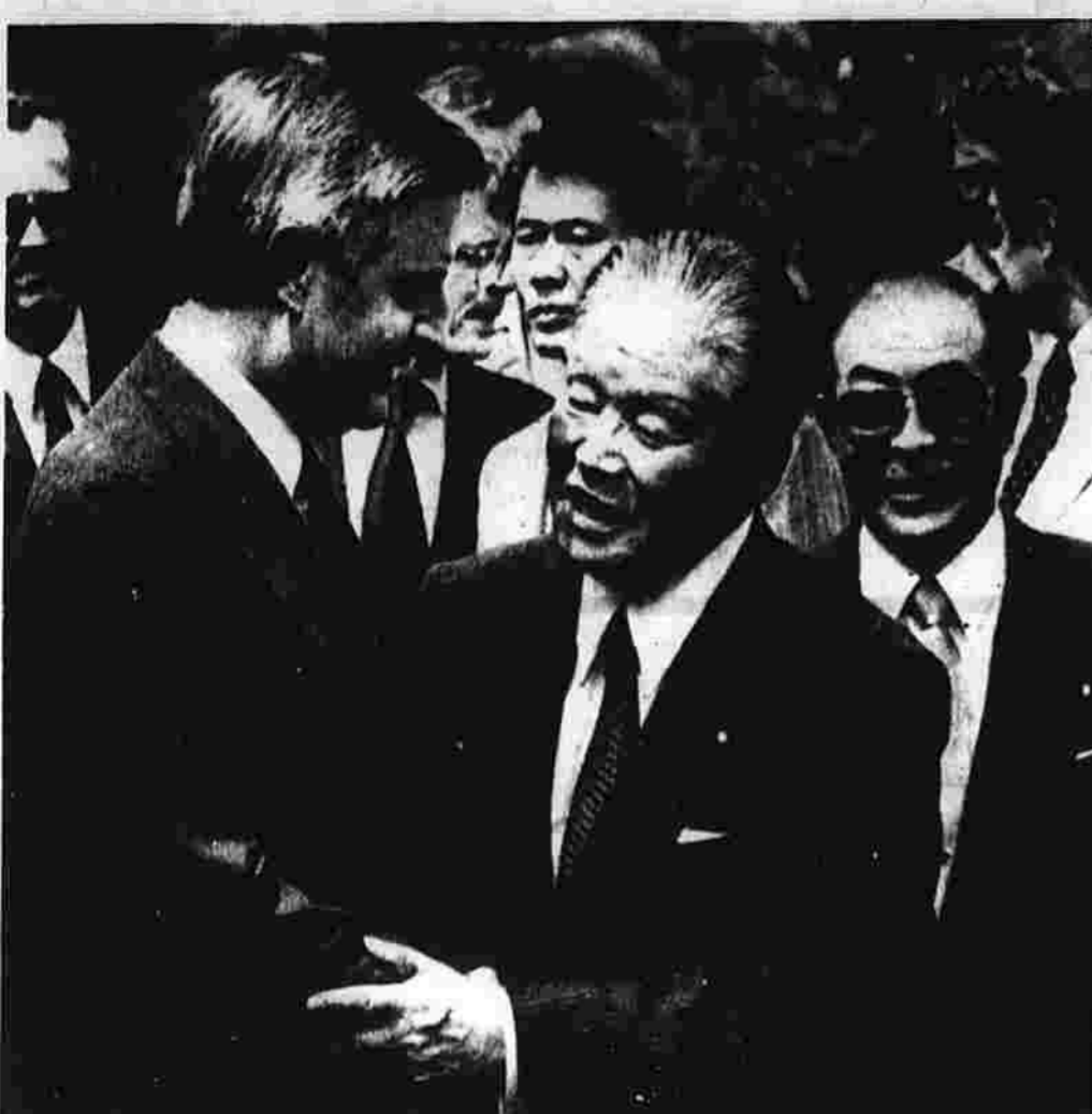
U.S. Vice President Walter Mondale, left, is greeted by Japanese Prime Minister Masayoshi Ohira Monday as he arrives at a guest house in Tokyo for a working lunch with Ohira. Looking on is Foreign Minister Sano.