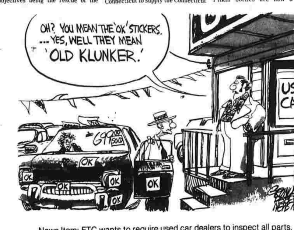
News Item: FTC wants to require used car dealers to inspect all parts.